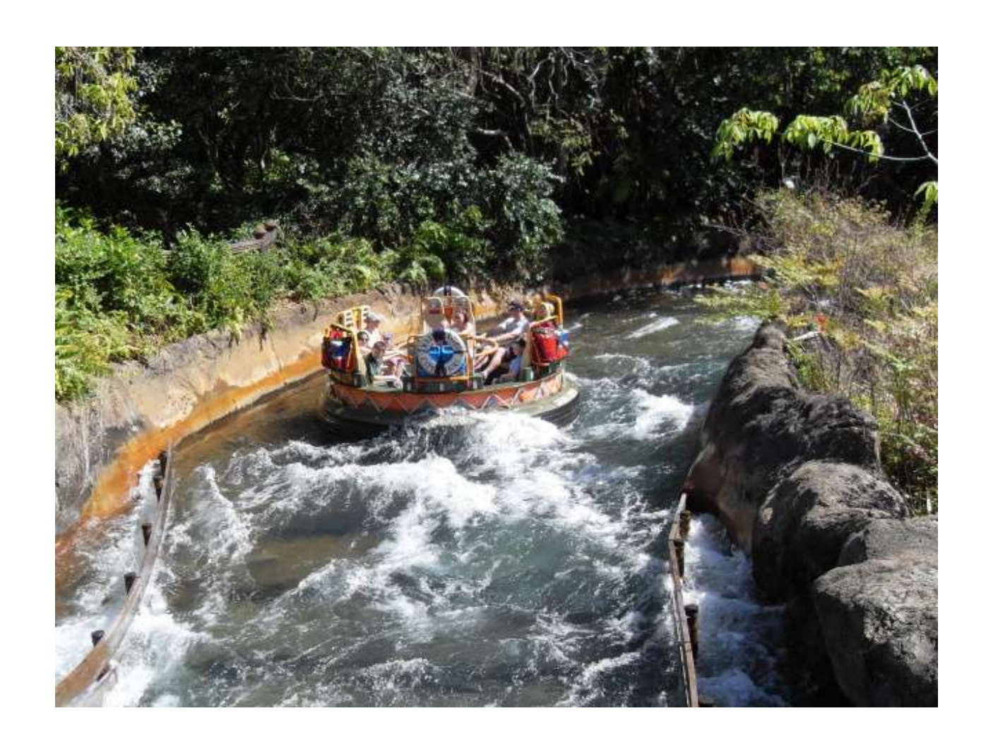
and Kali River Rapids,